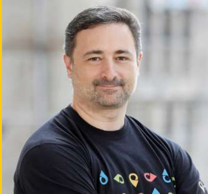
Igor Smelyansky CEO of Ukrposhta (Ukrainian National Post)